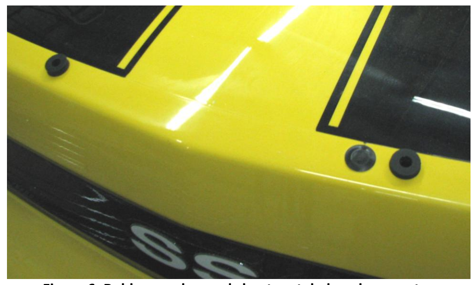
Figure 6: Rubber washer and sheet metal plug placement