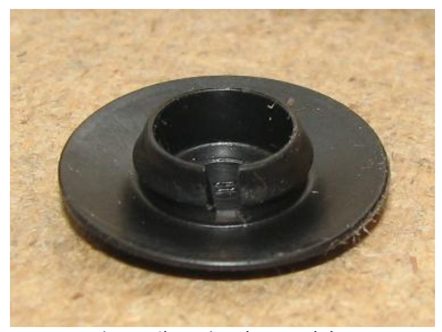
Figure 5: Slot cut into sheet metal plug

7. Take the supplied sheet metal plug and cut a small section out of the base as shown. This greatly eases installation. See figure 5.