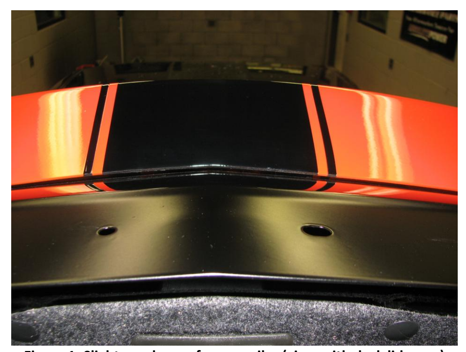
Figure 1: Slight overhang of rear spoiler (view with deck lid open)