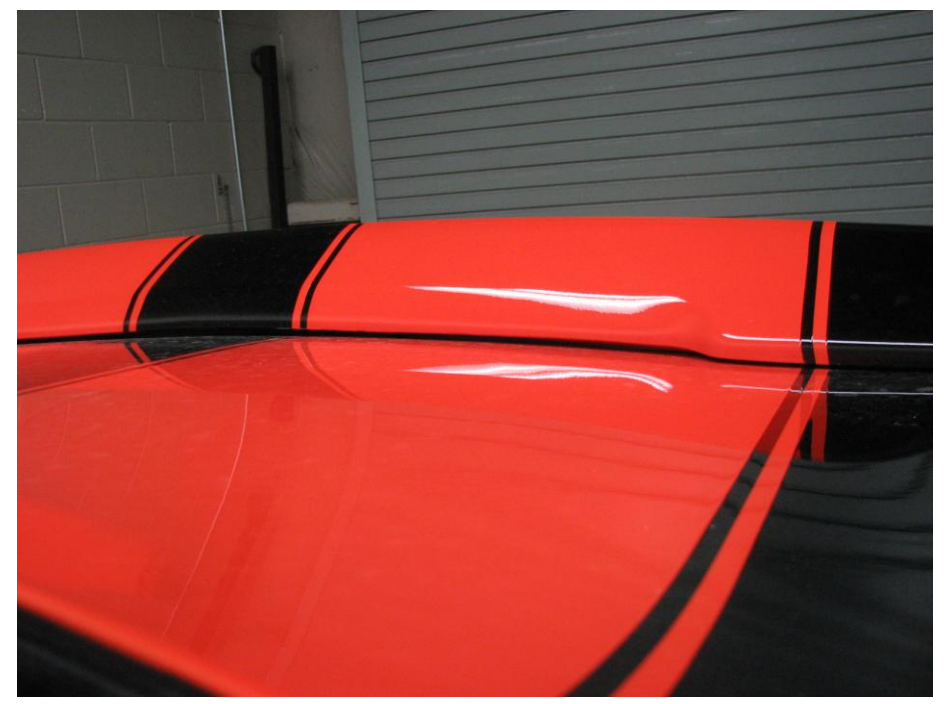
Figure 2: Center gap for drainage

6. Take the supplied spoiler spacer kit and apply the rubber strips to the front, back, and sides of the spoiler as shown. Cut side pieces as necessary. Take 4 of the foam washers and insert on the 2 outermost studs as shown. See Figure 3.