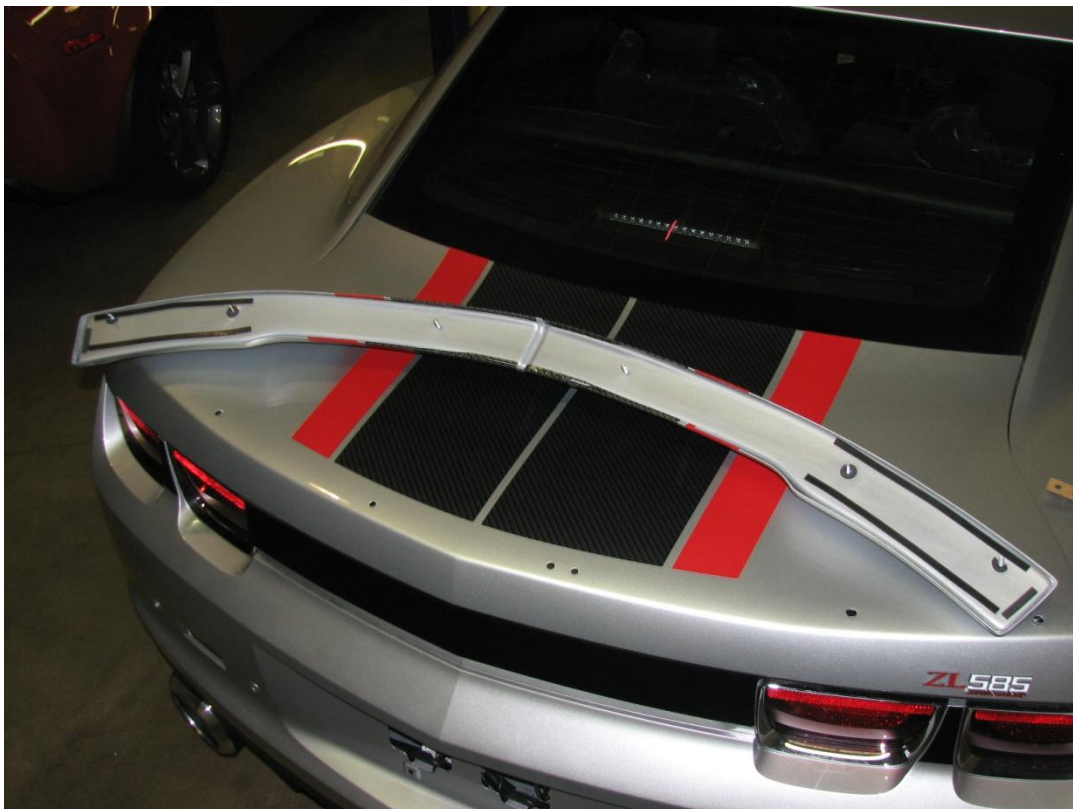
Rubber strips and foam washers applied