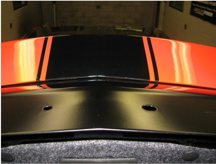
Slight overhang of rear spoiler (view with deck lid open)