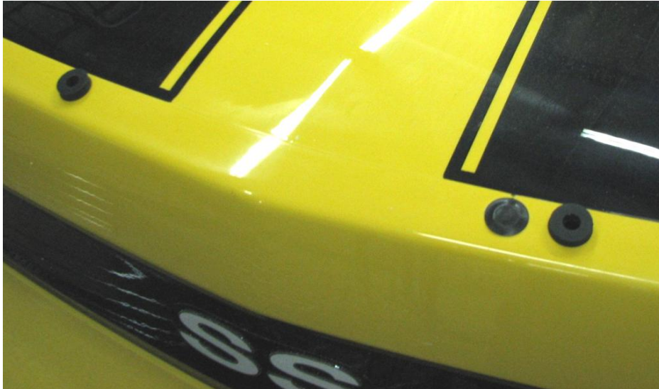
Rubber washer and sheet metal plug placement