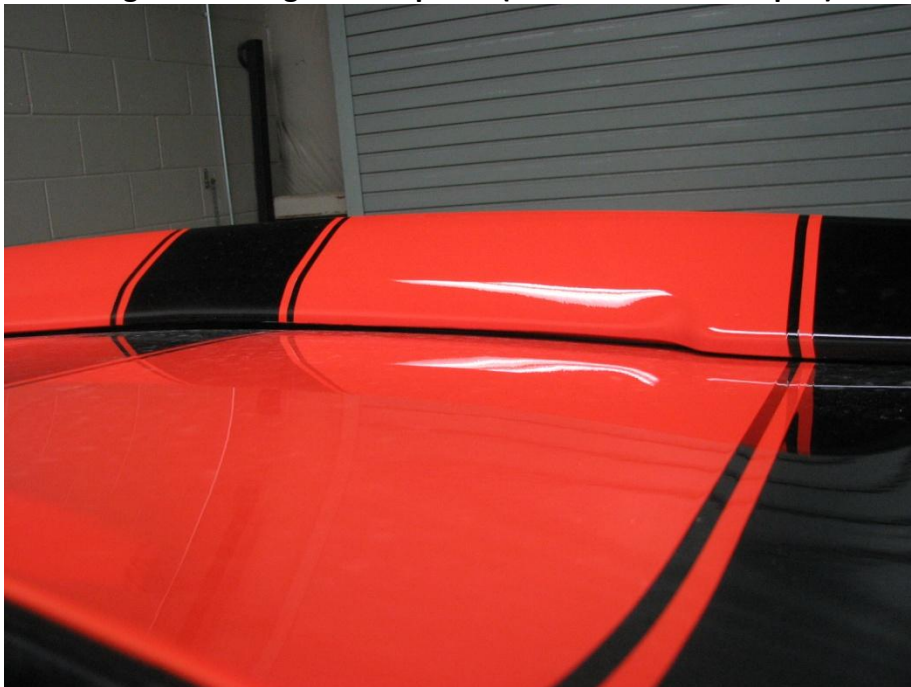
Center gap for drainage