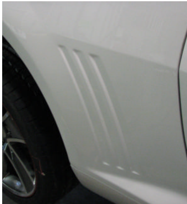
Figures 1 and 2: Decal solution and area to spray first