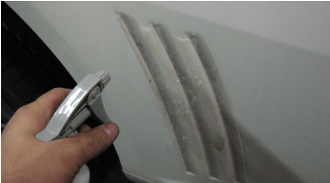
Figure 5: Spraying of backer once fully applied