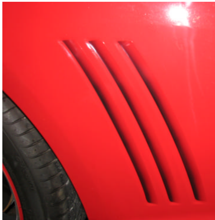
Figure 6: Finished Decal Installation