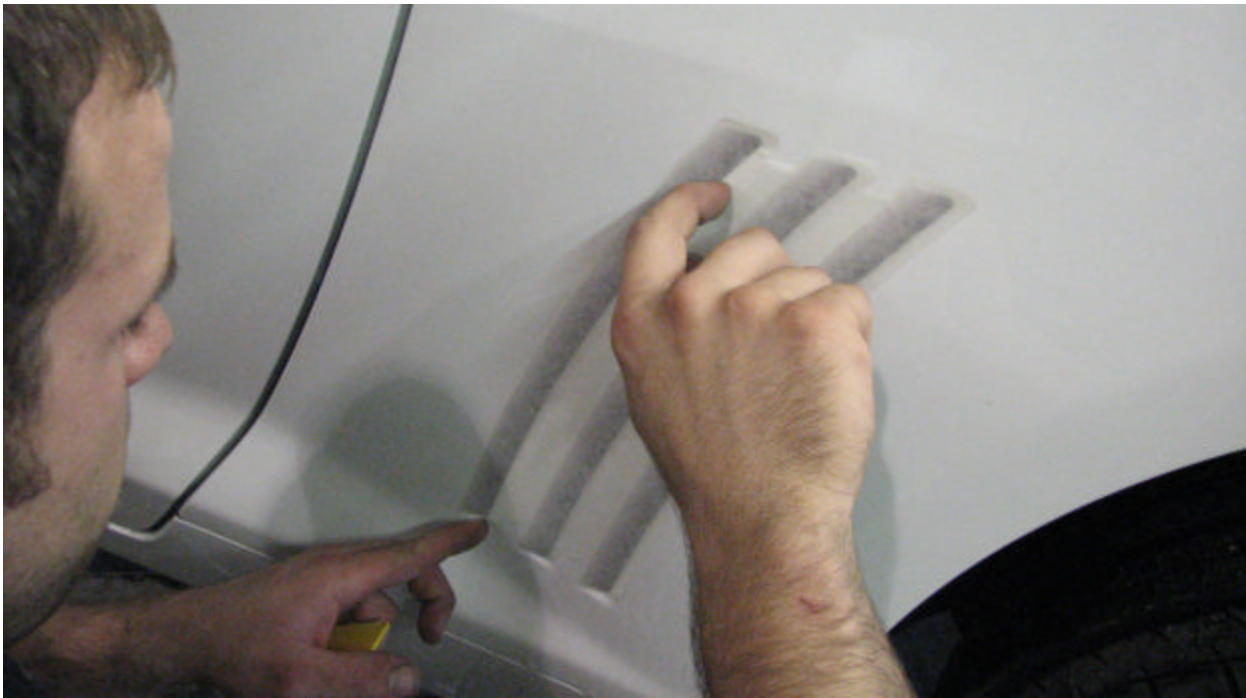
Figure 3: Lining up of front edge of decal with front edge of gill on vehicle