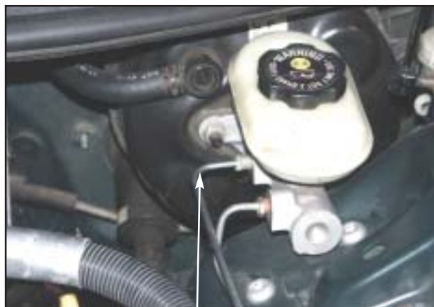
Figure 1: Master Cylinder to Solenoid Brake Line