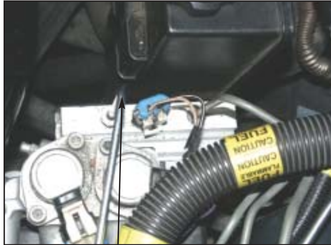
Figure 2: ABS to Solenoid Brake Line