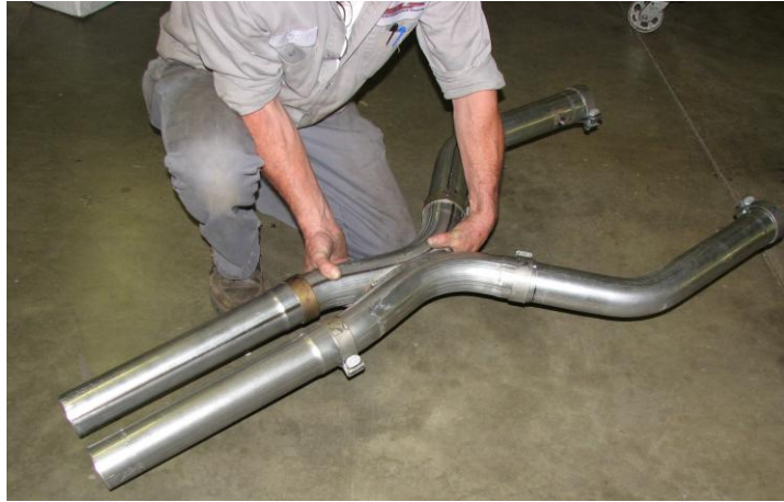
Figure 2: X-Pipe assembly (to SLP headers shown)

*Note* The X-pipe is directional. The bend in the pipe is subtle, and care should be taken to ensure it is installed properly. While holding up the X-pipe with the resonators (or straight pipes), look to see that they slope slightly downward. This is the proper orientation.