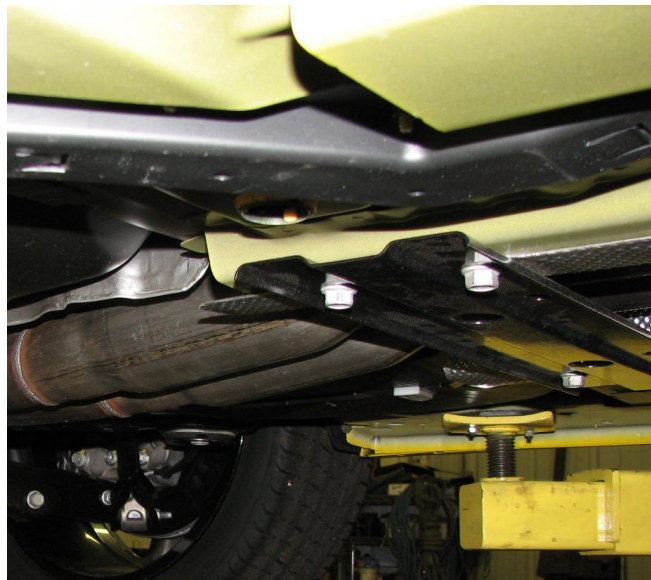
Figure 1: Removal of center support bar