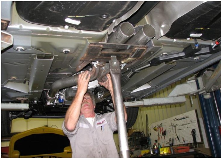
Figure 4: Installation of X-Pipe assembly