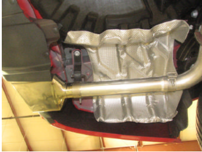
7 Figure 3: Installation of driver side section