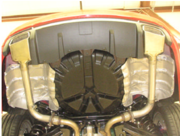
Figure 4: Finished installation