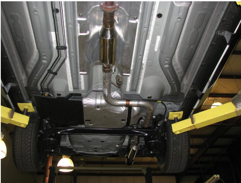
Figure 1: SLP Intermediate with muffler Installed