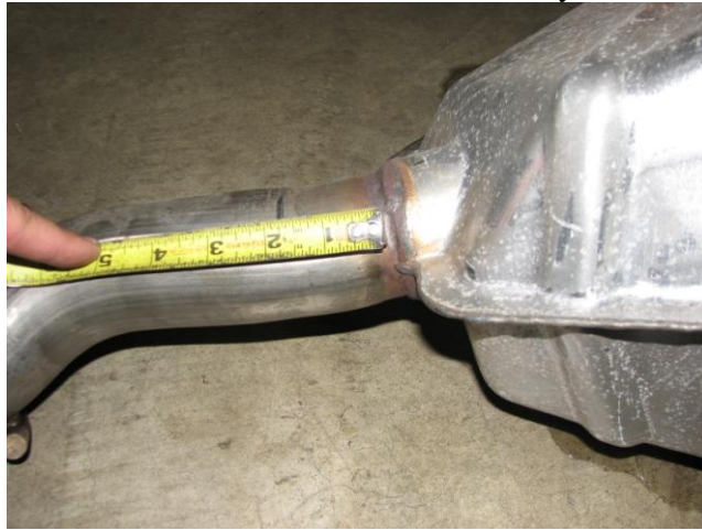
Figure 1: 1.75" from weld on rear muffler