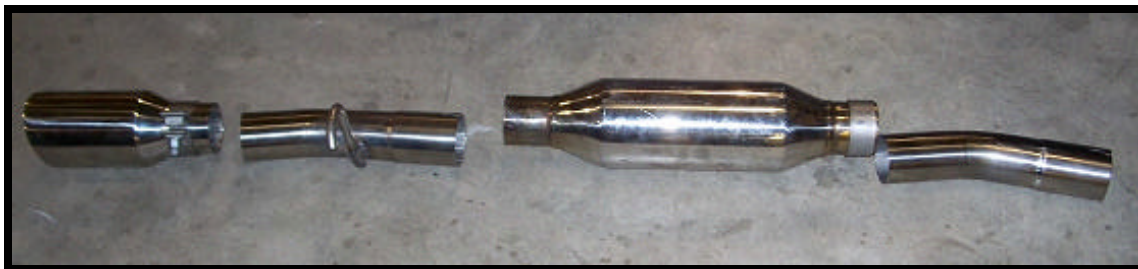
Figure 2: Tail Pipe Section for Assembly Outside of Vehicle