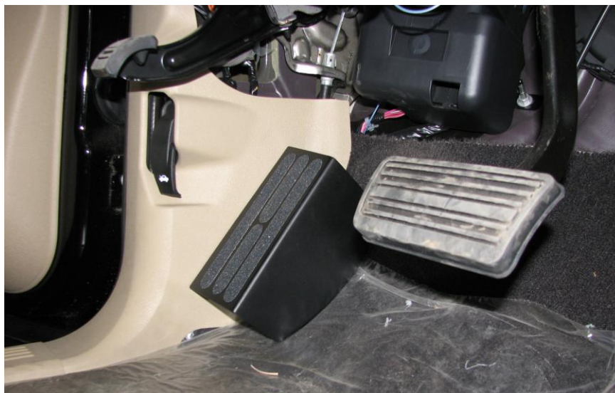
Figure 6: Finished installation