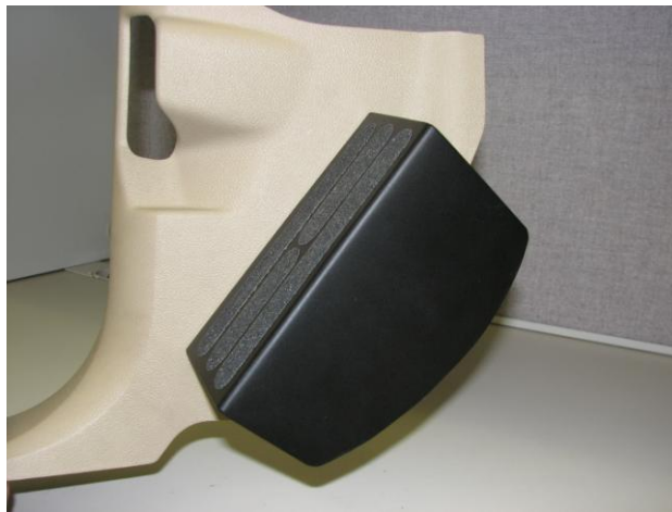
Figure 5: Dead pedal mounting