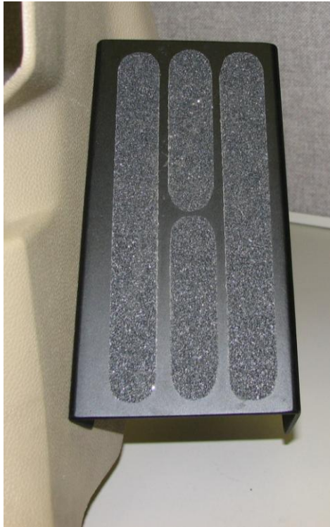
Figure 2: Grip tape placement