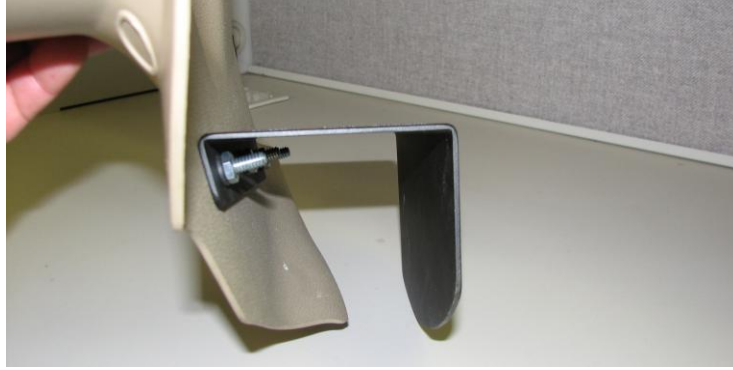
Figure 4: Dead pedal mounting