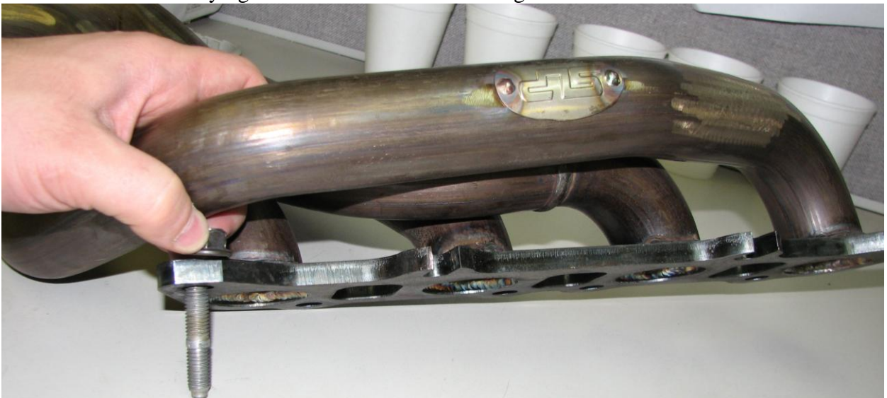
Figure 3: Stud and nut inserted into DS header before installation