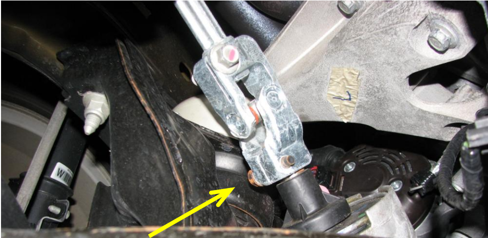
Figure 1: Remove this bolt from steering shaft